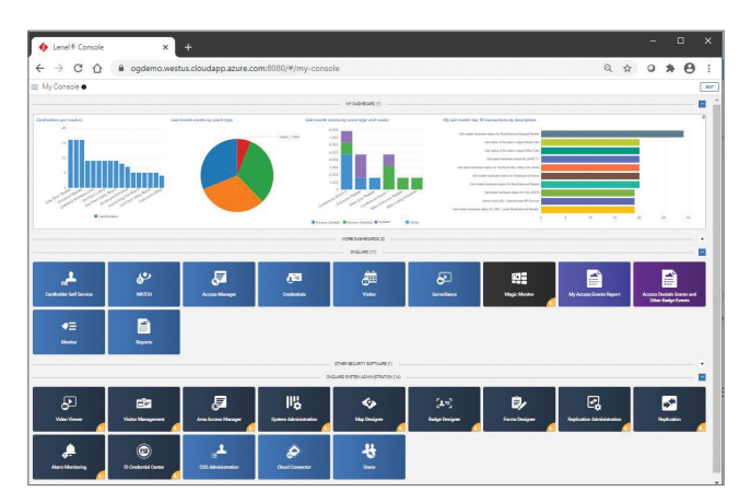
LenelS2 Console launchpad featuring OnGuard Reports client and OnGuard Dashboard display