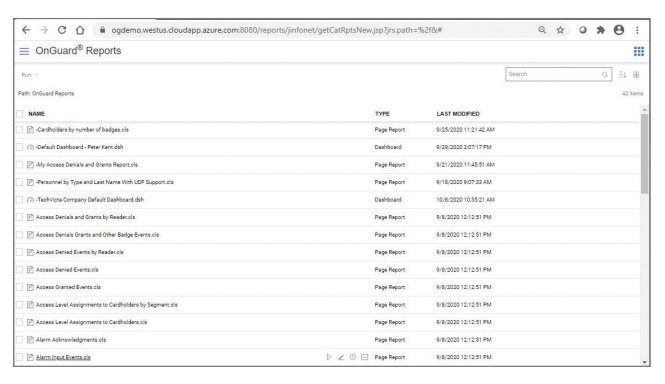
OnGuard Reports client - list of reports