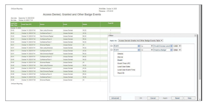
Customized Report with filter dialog