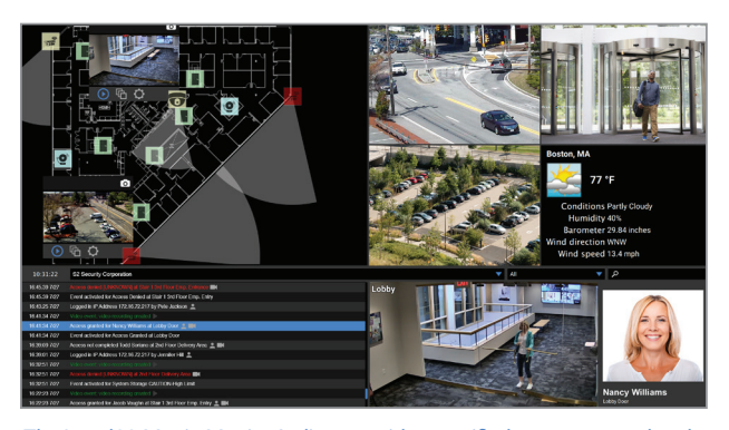
The LenelS2 Magic Monitor® client provides a unified access control and video surveillance experience.

The NetBox Extreme system is well suited for mid-scale deployments. As organizations grow, migration to a NetBox Enterprise system is seamless. Large, distributed organizations can centrally manage multiple NetBox controllers with a NetBox Global server, allowing for virtually unlimited scalability.